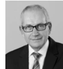
Steve Blackshaw Construction