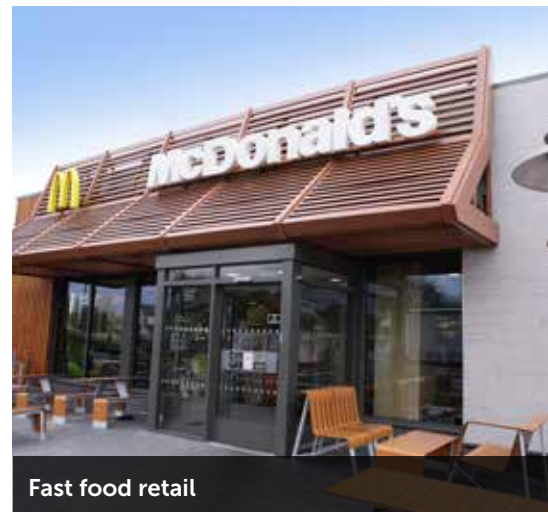
Fast food retail